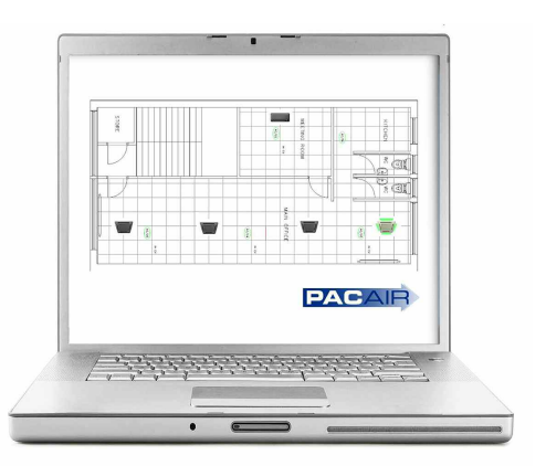
PACAIR's TG2000 Main Screen